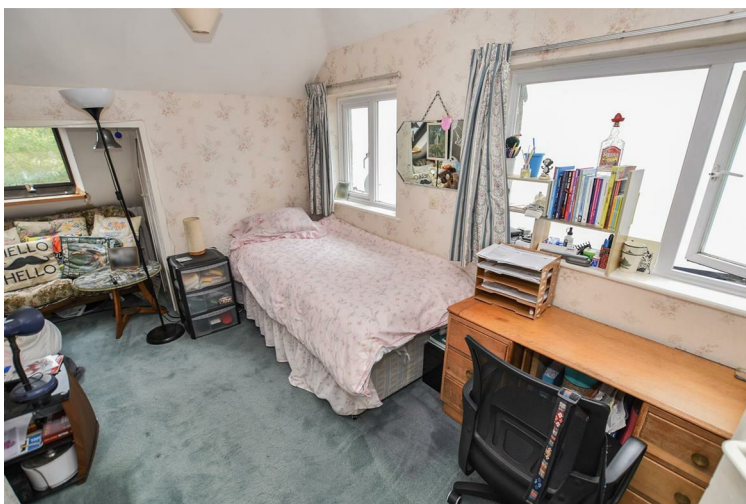
Bedroom Two 15'8 x 10'10 max (4.78m x 3.30m max)

Approx. 100FT x 40FT South facing mature landscaped garden mostly laid to lawn with flower bed borders, patio area adjoining the property, wooden garden shed, side access and access to garage.